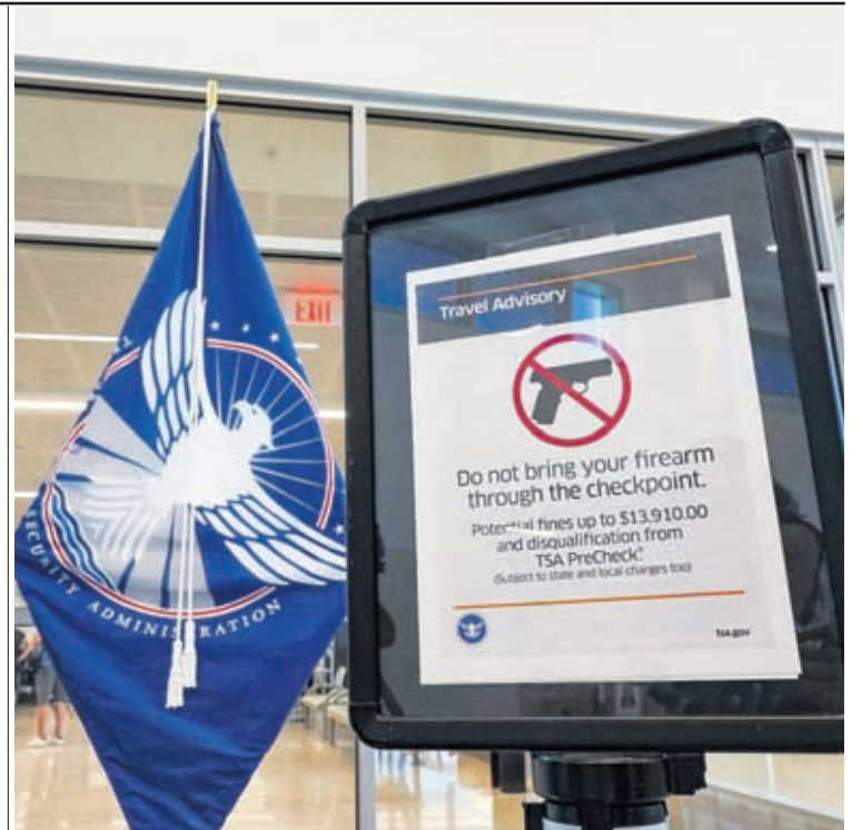
A sign advises airline travelers not to bring their firearm through the Transportation Security Administration checkpoint on, July 28, 2022, during a media event about traveling with firearms at the Brownsville-South Padre Island International Airport in Brownsville, Texas.

Additionally, the Republican Texas governor has pushed continued efforts to build former President Donald Trump's wall using mostly private land along the Texas-Mexico border and crowdsourcing funds to help pay for it. □